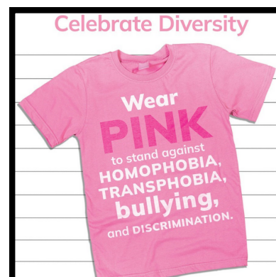
A message from the Comox Teachers' Association